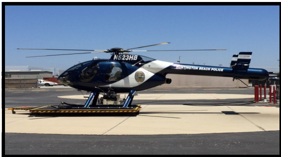
HBPD Citizens Academy Brochure, Rev. 5-2017

Whether you are a community leader, a long term resident, new resident, or live outside the city but work in the City of Huntington Beach, your attendance is welcome. The only additional requirements are that you must be at least eighteen years of age, have no outstanding warrants for your arrest, and no pending criminal cases.