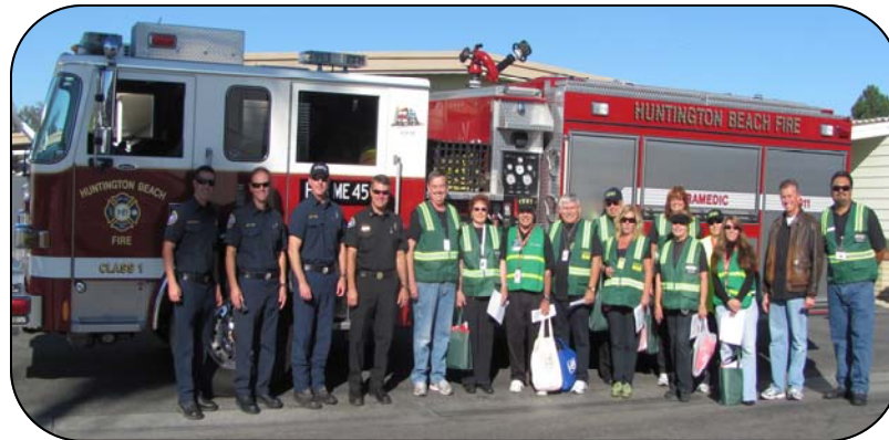
October 8 Team