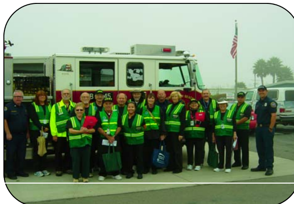
October 22 Team