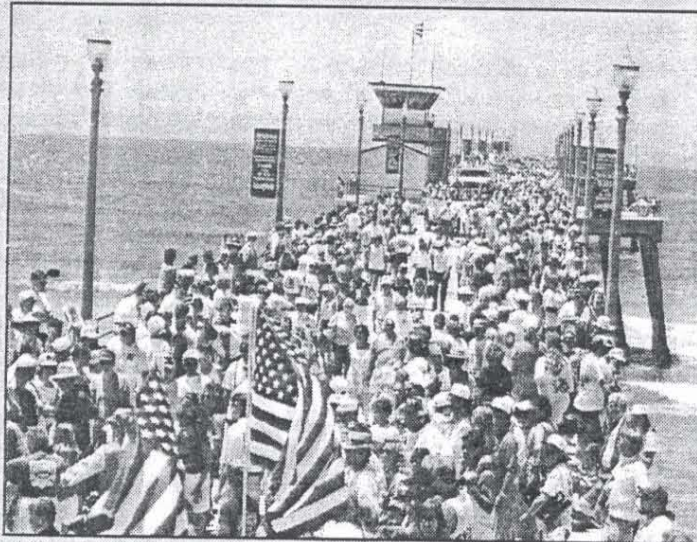
Getting ready for the Great American Race at the Huntington Beach Pier.