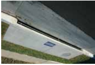
The Effect on the Ocean

Non-point source pollution can have a serious impact on water quality in Orange County. Pollutants from the storm drain system can harm marine life as well as coastal and wetland habitats. They can also degrade recreation areas such as beaches, harbors and bays.